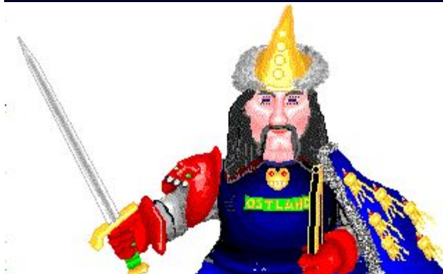
Valmir Von Raukov, Elector Count of Ostland

Teclis then introduced Eltharion as Karl Frans motioned for every one to be seated.