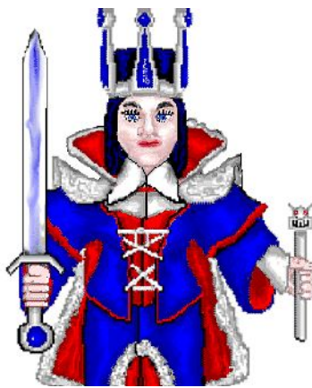
Katarina, Tzarina of Kislev