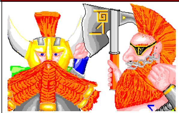
Ungrim the Slayer King and Gotrek Gunderson

As they stood there laughing, another two dwarfs came over to them dragging the massive jerking torso of a black orc and flung it on the fire. The dwarfs looked the same in some ways and quite different in others. Both were massive nearly as wide as they were tall with huge