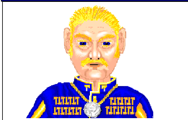
Karl Frans, Emperor, Prince of Altdorf

"No, but the last time you were here on other than a crisis, was when you stayed that one year in my youth, to tutor me on Elven history and the powers of magic, twenty years ago." He smiled fondly as they approached