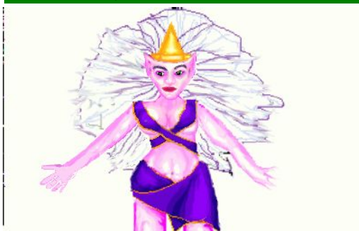
Lilita, Dark Elf Sorceress

Lilita glared and snarled at him. Ratkiller paid her no mind and reached out to take a piece of the corpse roasting in the fire. The sorceress reached for it at the same time and stared in shock when he grabbed it first. When she stretched out her hand to him to demand the chose bit of flesh, Ratkiller just laughed and took a bite. Angered at this disrespect, Lilita leapt to her feet and started to cast a spell. Ratkiller grinned and with short chopping motion